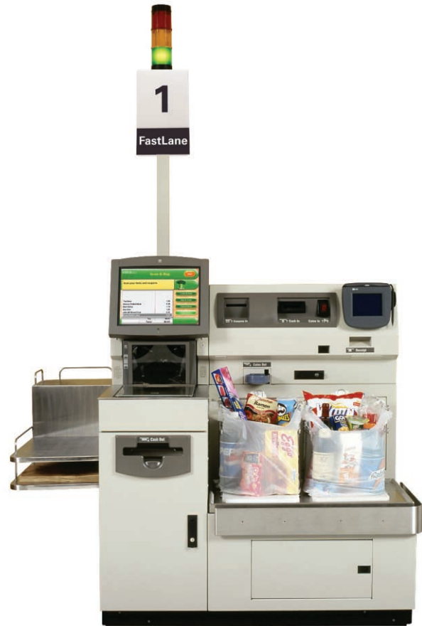
(Dimensions of Express unit: 59.5" long x 31.5" wide; also available with one bagwell)

With self-service adoption growing at a steady pace, consumers have come to expect self-checkout at their favorite retail locations. With NCR FastLane you can satisfy the growing consumer demand for self-service.