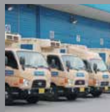
<Food & Beverage>