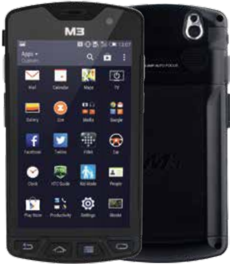
Android 4.3 Jelly Bean

01 Robust and rugged smartphone! A Stylish Smartphone with industrial durability